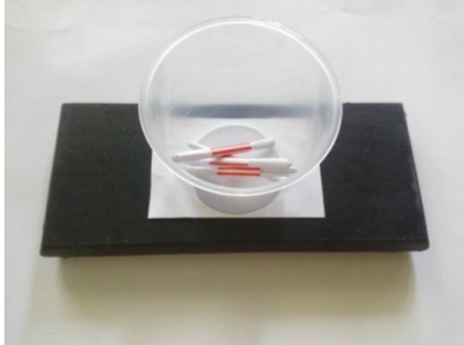
Figure 2. Manipulative Tool for Playing the Lottery

2. “Playing Lottery” ; teacher provides a bowl containing four rolls of paper that have written some kinds of sports, i.e. volleyball, football, swimming, and martial.