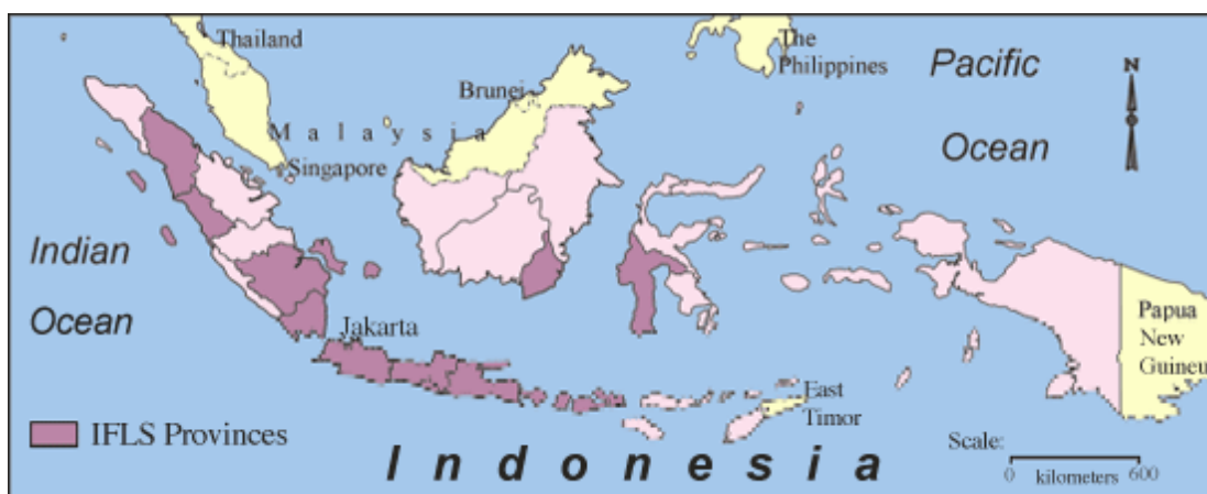
Figure 1. IFLS Survey Coverage

The data set used in the empirical analysis is the Indonesian Family Life Survey 4 (IFLS4). The coverage area of the survey can be seen in Figure 1. The survey collects data on individual respondents, their families, and their households. IFLS4 was fielded in late 2007 and early 2008. It was a collaborative effort by RAND, the Center for Population and Policy Studies (CPPS) of the Gadjah Mada University, and Survey Meter.