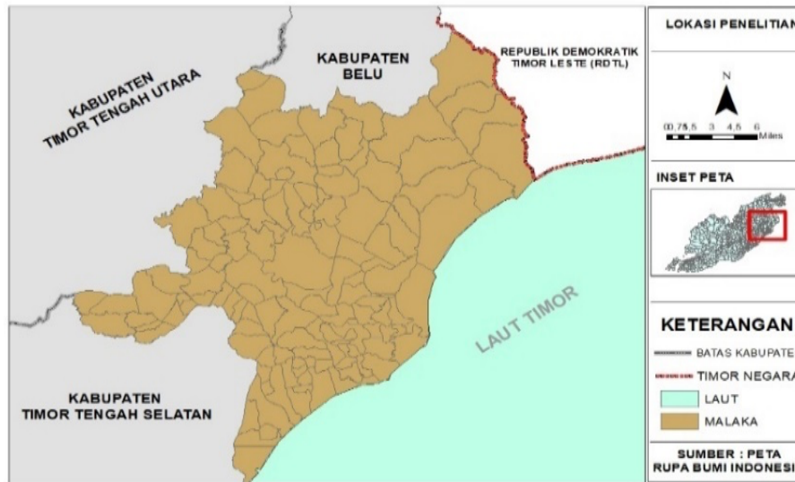
Figure 2. Map of Malaka Regency and Research Location

This research uses two types of data, namely primary data and secondary data. Primary data was obtained directly from respondents or research samples, who are the community of women farmers. Meanwhile, secondary data is information obtained from government institutions, especially data publication documents that are closely related to the research objectives. The primary data collected involved the active participation of the farmer communities that were the respondents in this research. They provided direct information related to farming practices, challenges faced, and various aspects related to the opportunities and challenges of women farmer's roles in the advancement of the sector. Meanwhile, secondary data was obtained from government institutions, especially the Central Bureau of Statistics of ENT Province, (2023). The data includes information on the number of women farmers in the four districts that are the focus of the research, the amount of contribution of the agricultural sector to the formation of gross regional domestic product ( PDRB ), and the amount of production and consumption of rice in the community. The use of these two types of data is expected to provide a comprehensive framework for understanding the sustainability of women's roles in inclusive agricultural sector development in the ENT-Timor Leste border region.