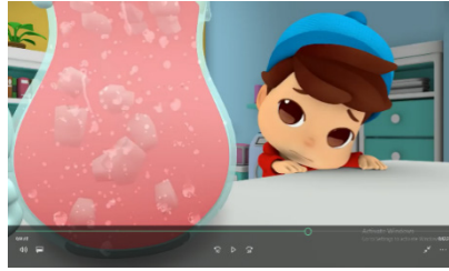
Figure 5. Patience Episode “Mission of Fasting”