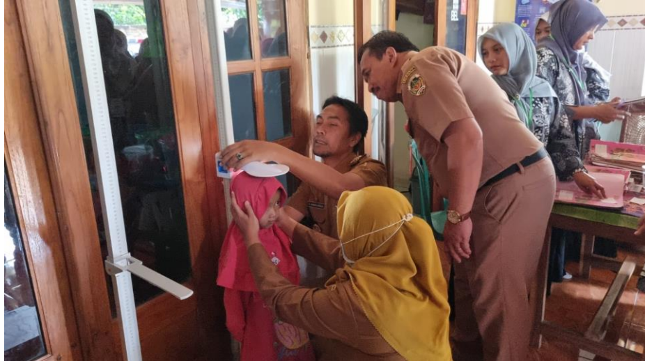
Figure 1: Implementation of Weighing Month by Madiun District Government

determines that the stunting prevalence rate in each country must be less than 20%. Through this standard, President Joko Widodo targets a reduction in stunting by 2024 down to 14%. Based on data from the Indonesian Nutrition Status Survey (SSGI) released by the Ministry of Health, the prevalence of stunting in Indonesia in 2022 decreased by 2.8% points from 24.4% in 2021 to 21.6% (Kementerian Kesehatan, 2023). With a decrease of 2.8% points in 2022, the prevalence of stunting must decrease annually by 7.6% points to achieve the target in 2024. To achieve this reduction in stunting prevalence, it is necessary to accelerate the stunting handling program in every region in Indonesia.