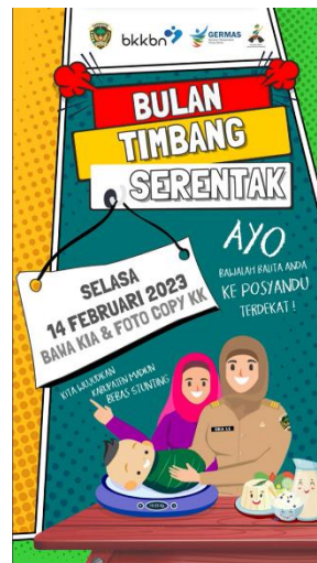
Figure 2: Simultaneous Weigh-in Month Social Media Content

conventional patterns because the delivery of messages is done online, one of which is through social media.