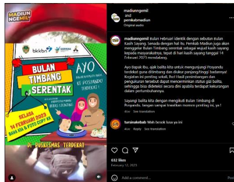
Figure 4: Weigh-in Month Campaign Content

Through this creative process, the @madiunngemil account creates social media content in the form of a 1-minute video. In uploading this video, @madiunngemil also tagged the @pemkabmadiun account. Through these tags, it can be shown that there has been collaboration between the two accounts. The following is an image capture of the social media content uploaded by the @madiunngemil account.