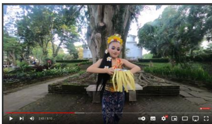
Figure 2. Youtube Endra toyan Pendet Dance 3600

However, in this virtual reality, researchers provide an overview of SWOT analysis. According to (Ratnawati, 2020), SWOT is a systematic identification of factors to formulate strategies; this analysis is based on logic in emphasizing multimedia's strengths and opportunities while minimizing weaknesses and threats (Ratnawati, 2020). SWOT analysis is carried out with the stages of data collection (internal and external conditions), data analysis, and decision-making (Taruna, 2017).