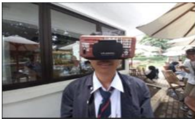
Figure 1. VR Trial to Students

In this Virtual Reality Workshop, the class action method is carried out by researchers to workshop participants or vocational teachers. Researchers provide stages in introducing Video Virtuality in art learning to improve Vocational Teacher skills. Vocational Teachers must determine the objectives in the learning offered by the researcher (VR Project), the teacher must determine which art concept (Dance) will be used as an example in the virtual reality video playback, and the Vocational Teacher must determine the choice of content to be created. The Vocational Teacher creates content until the editing stage and is presented and then shown to other workshop participants. This project emphasizes improving the skills of Vocational Teachers and collaboration from various disciplines such as Art, ICT, and Multimedia. The following in figure 1 and figure 2 are the content prepared by researchers in the Art learning workshop for vocational teachers.