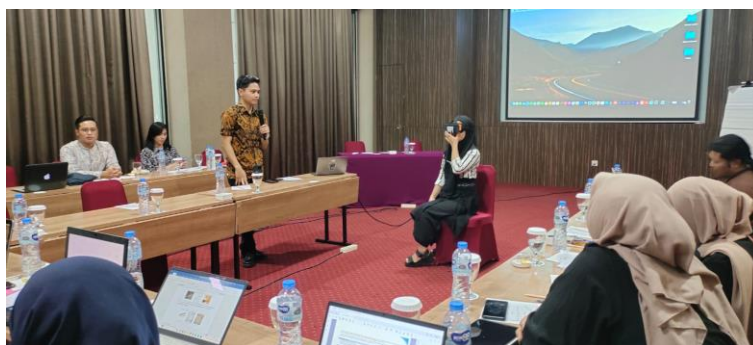
Figure 7. Art Learning Workshop for Vocational Teachers, VR Trial to Vocational Teachers

Miarso (2004) says that the effectiveness of learning is one of the quality standards of education and is often measured by the achievement of goals, or it can also be interpreted as accuracy in managing a situation, "doing the right things" (Rohmawati, 2015).