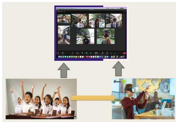
Figure 6. Classroom scheme

Be sure to consider the resources and budget you have available for this project.