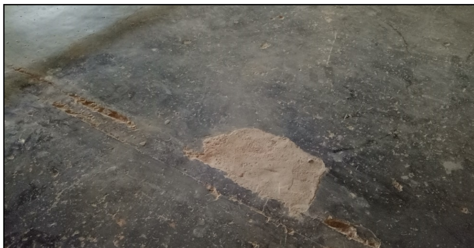
Figure 2. Cement-Patched Workshop Floor

This is due to the research findings that the regulations required the students to be disciplined and obedient, firm by teachers when teaching field practice, and a school environment that supports students to always be on time. The results support previous research, where individuals and groups have achieved information about OHS (Nugroho et al., 2019). In addition, there was also a significant influence of OSH knowledge and attitudes on the implementation of OHS (Pangeran et al., 2016; Sidauruk et al., 2014; Simanjuntak et al., 2012). In addition, the implementation of OHS also included the workshop work environment. The work environment in both workshops required attention and improvement. The requirements for the workshop work environment should have a balanced layout, such as sorting by a group of workers and re-adjusting tables, chairs, and tools to make them more ergonomic. For example, a workshop floor needs repair.