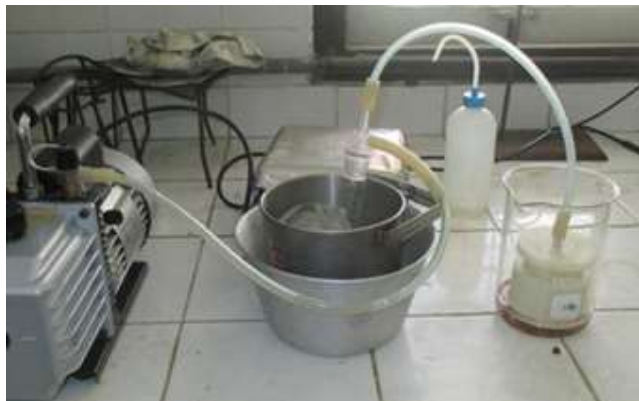
Figure 2 Seawater filtration process

agent \text{FeCl}_3 washed using distilled water until free Cl.