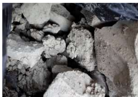
Figure 1 Natural Clay of Boyolali

Preparation of Pillared Clay. As the host materials, natural clay samples from Banyusri Village, District Wonosegoro, Boyolali (Central Java). Natural clay shown as Figure 1. Stages of preparation done by washing using water DM, clays that have been washed, dried using an oven at 100^\circ C for 2 hours to remove moisture and volatile impurities. The dried clay crushed and filtered using 170 mesh sieve to obtain the size of clay particles that were smaller and uniform.