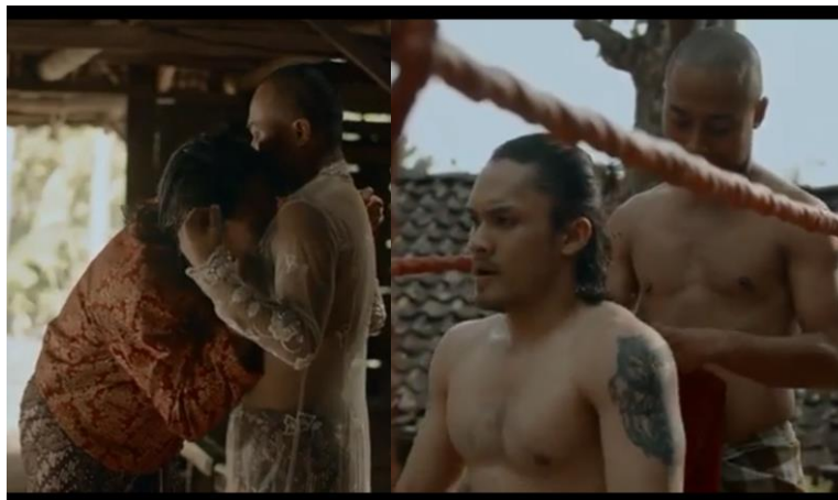
Figure 5. Juno's intimacy scene with the boxer (00.48.40 & 00.50.20)

One of the important questions in developing a gender change process is whether it is possible to deconstruct gender as a binary? Alsop, Fitzsimmons, and Lennon as cited by Jewkes et al. (2015, p. 132), stated that critical studies of masculinity that draw on social constructionism often still retain residual essentialism that the separation between men and women and the assumption that masculinity belongs to men and femininity to women undoubtedly underlies the analysis.