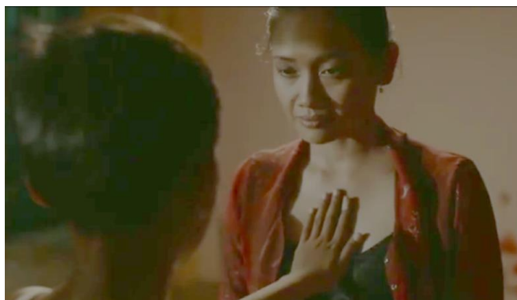
Figure 7. The scene depicts Juno's longing for her mother, which results in her teacher being expelled (00.31.50)

After seeing for herself the violence that occurred, in the next chapter Juno becomes a victim. When he angered his aunt, his hand would be pricked with a needle. A practice that might have been considered 'normal' at the time. He was also bullied by his classmates at school and punished by the teacher for making noise. The only teacher who paid attention to the boy had to be expelled by residents because they were accused of committing immoral acts together while practicing dance at the female teacher's residence. For the second time, Juno had to change residence. Then, he lived with his uncle.