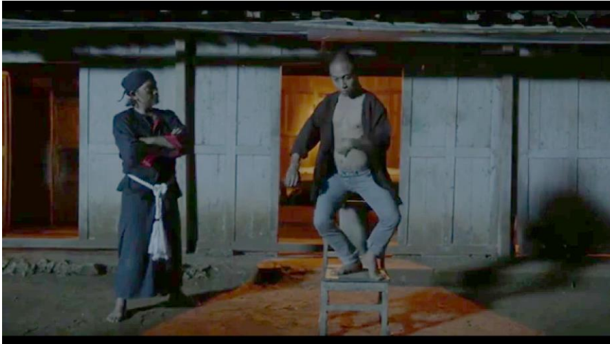
Figure 3. The scene when Juno is confirmed as Warok's symbol (01.32)

In his study, Potgieter (2006) explores the experiences of men who dress and construct their bodies and identities as 'feminine' and interprets the social, political, psychological and economic consequences of these constructions. Despite expressing 'alternative' forms of masculinity and femininity, hegemonic norms of masculinity and femininity are relatively unchallenged by same-sex relationships.