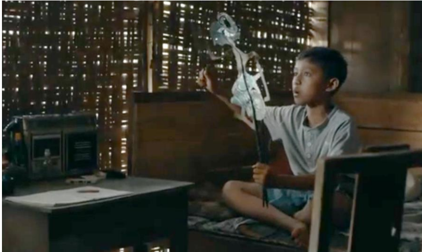
Figure 4. Juno is acting out the character of Arjuna like a puppeteer in a shadow puppet performance

Arjuna's characteristics then transform into the character Juno. The character Arjuna then inspired him to become a character in the film. As revealed by Efendi & Nurgiyantoro (2021) that wayang is a source of creative inspiration that can be adapted and adapted to various forms, such as comics, television drama series, and novels, as well as films. Through these various forms, wayang can be a medium for disseminating views and criticism of Indonesian culture, politics, and society at a certain time. As a source of inspiration, wayang offers an outline of characters and themes that are dynamic and contextual. Telling stories using wayang symbols can be one way to avoid censorship. On the other hand, through wayang, films can convey thoughts about the construction of tradition and culture from a different perspective from that of the government or state. Likewise in the depiction of gender deconstruction.