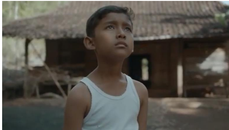
Figure 6. Childhood Juno's physical depiction (02.32)

Juno was born in a remote village on the island of Java which is known for its many people who work as dancers. Lengger Lanang studio, a term for male dancers who dance from a female dance point of view. The environment where she lives, which does not differentiate between a person's masculine and feminine sides, forms Juno's identity as depicted in the film (Prasetyo et al., 2020). Apart from that, Juno always experiences a fate that always brings violence, affection, and departure in various aspects.